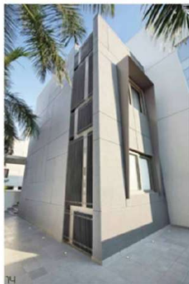
14 Note the exterior view of the bungalow.

The bedroom has attached walk-in closet and bathroom, designed in complete Italian stone cladding, wooden ceiling and intricate metal framed mirror along with hangings.