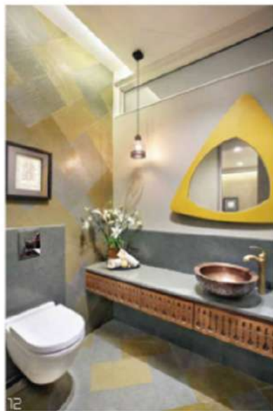
12 The common toilet features copper basin and brass faucet, lending old-world charm.